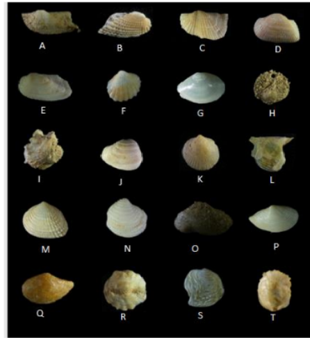
Figure 2. (A) Arca navicularis , (B) A. noae , (C) A. volucris , (D) Barbatia foliate , (E) B. stearnsii , (F) Cardites bicolor , (G) Cetoconcha hyaline , (H) Chama japonica , (I) C. pulchella , (J) Corbula scaphoides , (K) Glycymeris glycymeris , (L) Isongomon legume , (M) Liralucina lyngei , (N) Cardiolucina macassari , (O) Modiolus barbatus , (P) Saccella tashiensis , (Q) S. confusa , (R) Dendostrea folium , (S) Ostrea edulis , (T) Dendostrea rosacea .