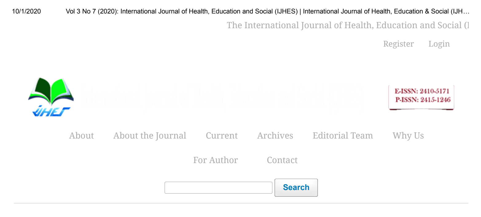
Home / Archives / Vol 3 No 7 (2020): International Journal of Health, Education and Social (IJHES)