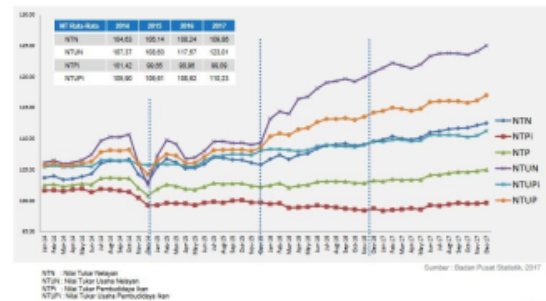
Fig. 2. The average exchange rate of traditional fishermen

economic income also increased. In 2017, the government managed to lift the growth in the field of fisheries. As in the visible from Fig. 1. while the average exchange rate of traditional fishermen per year has increased as shown in Fig. 2.