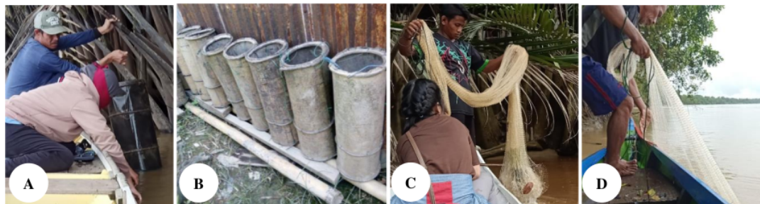
Figure 2. Fishing techniques used by fishermen in different sampling sites. A. Prawn traps, bubu (Salimbatu Village); B. Prawn trap, bubu (Buong Baru Village); C. Casting net (Tepian Village); D. Casting net (Sesayap Village)