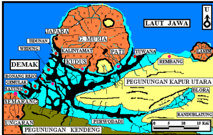
Geophysical condition of Demak-Grobogan Area around 15-16 AD