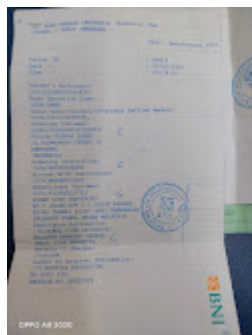
Payment for invoice INV22028.jpg 243K