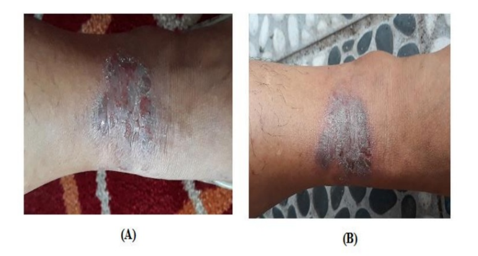
Figure 3. (A) Skin after 3 days of treatment; (B) Skin after 7 days of CFWC treatment

biodegradation by incidental bacteria. Charcoal was a new ingredient in the cosmetics world, which was currently popular in various parts of the world. It also claimed to bind sebum in the face to the pores due to the high adsorption power of charcoal [22]