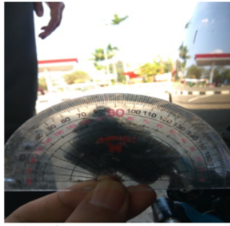
Fig. 2. Preparation of the survey vehicle: (a) warning sign at the back of vehicle; (b) height position of video camera; (c) angle position of video camera tilt

After several trials, it is decided that the best position of the video camera was on the height 45- 50 cm above pavement surface and on the angle tilt 45^\circ . As the result, one could see the video of the distress on one lane clearly. The use of lower height and less angle tilt could cause the video produced to be convex and uncomfortable when viewed during analysis.