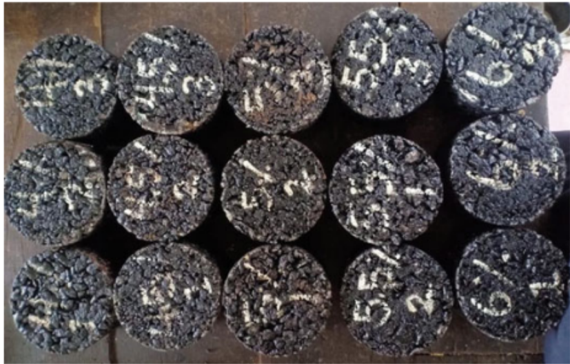
Fig. 1 Specimen of porous asphalt