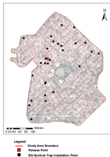
Fig. 1. Batan Indah site.

The study site, Batan Indah Residence, is suburban residential area located in Kademangan sub-district, Setu district, South Tangerang Municipality, Banten Province. This location was chosen as study site due to high prevalence of Dengue fever cases in South Tangerang Municipality [18] and was already set as capture site for monitoring mosquito population from previous program conducted by BATAN. The Batan Indah Residence has a land area of 32 hectares and consist of around 1.000 household. 28 of BG-Sentinel traps (Biogents, Germany) were installed in different point over the study site (Fig. 1).