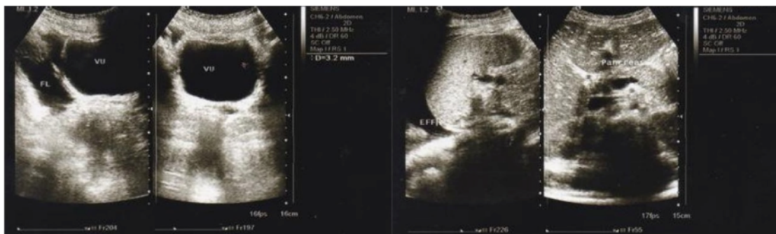
Fig. 2. Abdominal ultrasonography showed acalculous cholecystitis, right cholestasis, ascites on 5th day.

surgical morbidity due to the presence of DF can be avoided [13]. Initial hematological laboratory result which is inconjunct with abdominal ultrasonography findings can help physicians to consider this diagnosis [14]. The involvement of cholecystitis may lead to gallbladder wall thickening (GBWT). This sign appears due to increased capillary permeability. The hallmarks of ultrasonography findings on AAC diagnosis in pediatrics rely on diagnostic criteria as follows: (1) increment of gallbladder wall thickness ( \geq 3.5 mm), (2) Pericholecystic fluid, (3) Appearance of mucosal membrane sludge, (4) Gall bladder distension. The thickness of the gallbladder above 3 mm is significantly associated with more severe dengue cases, whereas the thickness greater than 5 mm is associated with the risk of threatening hypovolemic shock [15]. Computerized tomography (CT) is considered as accurate as ultrasonography in diagnosing AAC. However, its radiological exposure restricts its use in the pediatric age and CT is not always available, more expensive and cannot be performed bedside [13]. Ultrasonography findings and laboratory parameters could not identify the causative agent of AAC. Bacterial AAC usually manifests with leukocytosis and increased inflammatory markers. Acute acalculous cholecystitis due to viruses has better prognosis than bacterial and improved with a conservative therapy, such as adequate intravenous fluid therapy, analgesic, and antibiotics [16].