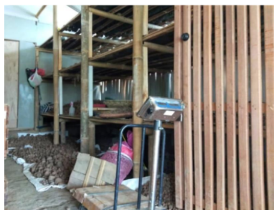
Figure 4. Porang storage area

The next step is making the planting hole and inserting the compost into the hole. Besides compost, some farmers also use a mixture of manure. The seed preparation stage includes selecting good seeds from tubers, bulbils ( katak ) and seeds (spores). In addition to planting porang in the usual way (one porang grows into one living plant), there are also farmers who plant porang by propagating it. One porang tuber seed from a katak can be multiplied into 4 seeds. There is also a special way for farmers to propagate. First, the porang katak seeds are cut into 4 parts. Then, the seed pieces are soaked in the blended shallot water and closed tightly for ½ day, then lifted and aerated. Next, the seeds are smeared with kitchen ash. Finally, when the seeds sprout, only then are they planted in the ground.