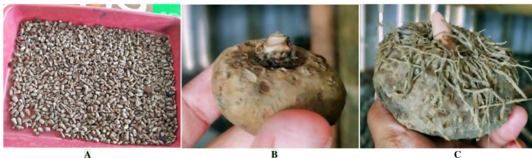
Figure 2. Organs of plant used for reproduction process. A. Seeds spora., B. Bulbil katak ., C. Tuber

For cultivation needs, seeds can come from tubers, bulbils ( katak ), and seeds ( spora ) of porang . These organs become seeds of different qualities. Usually, seeds that come from tubers are the best choice because they will produce tubers that are larger in size and weight compared to seeds or bulbils (Figure 2).