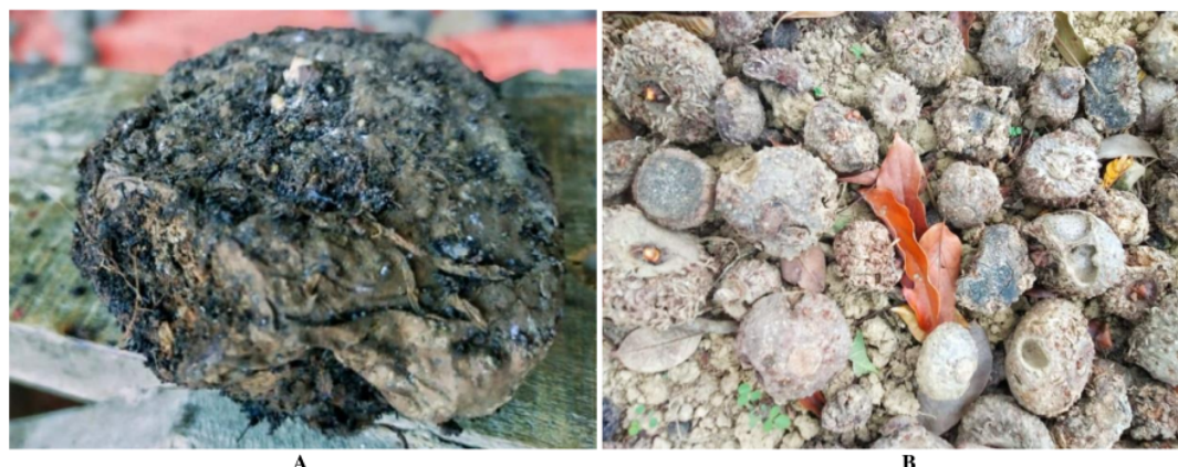
Figure 5. The porang tuber is not in a good condition. A. Porang damaged by rot, B. Porang damaged due to wrong storage methods