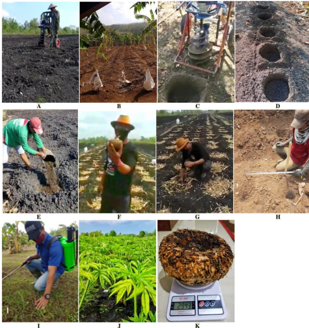
Figure 3. Stages of porang ( Amorphophallus muelleri ) cultivation. A. Soil loosening, B. Making beds, C. Hole making using a drill, D. Planting hole, E. Giving compost/manure, F. Selecting seeds from tubers, G. Planting seeds, H. Measuring planting distance, I. Fertilizing at 27 days after planting, J. Adult Porang plants, K. Harvested tubers

Porang cultivation is quite popular because it is quite adaptive in nature, easy to cultivate, and has high economic value. Porang plants can grow well in the Semarang area known as an area with various ecological conditions. Porang can thrive in cool and highlands such as Limbangan and Gunungpati areas as well as in hot lowlands such as Ngaliyan. However, like other members of Araceae, porang does not require prolonged exposure to the sun, for optimal growth porang must live 40-60% in the shade. In addition, according to Jansen et al. (1996) porang requires a good drainage system so that water does not stagnate which causes rot in the roots and tubers.