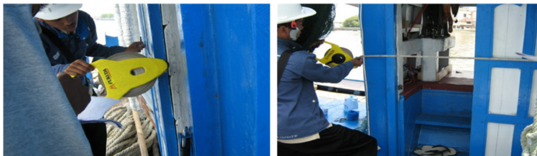
Figure 1. Survey and Measuring of Batang type Traditional Fishing Boat