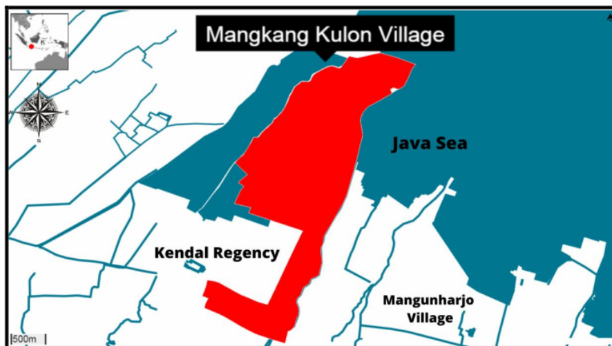
Figure 1. Mangkang Kulon Village.

Mangkang Kulon Village, located in Tugu District, Semarang City, is chosen as the study site (Figure 1). Through a quantitative approach supported by existing literature as reference techniques (Cahillane & Schweppe 2016; Dobinson & Johns 2017), data collection was done through document review and field observations from October until December 2018.