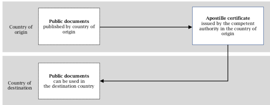
Figure 2. Procedure for ratifying public documents after the Apostille Convention

It can be seen from Figure 2 above that the enactment of the Apostille Convention will simplify the procedure for legalizing public documents so that it is more effective and efficient because it does not involve many agencies. The Apostille Convention only requires one formality to ensure the authenticity of the signature/stamp/stamp and the authority of the official who signs the document, namely by issuing an apostille certificate or an along by the competent authority of the country where the document is issued. The apostille or along certificat must be included in the document applied for at the request of the person who signed the document or bearer of the document. On the apostille certificate, there will be a register number that is connected online to the ICCH website, so that all countries participating in the Apostille Convention can access it.