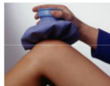
Fig. 3. Heat compresses

Furthermore, when it is related to the placement of TENS electrodes, placed around the location of pain, dermatome, trigger point area, and motor point. When electrodes are placed on the location of pain, this method is the easiest and most frequently used, because this method can be directly applied to the pain area without regard to the most optimal character and location about the system that is causing pain. Placement in the dermatome area