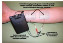
Fig. 1. TENS

precisely have been utilized by many inventors. The frequency provided by this device is adjusted to the mechanoreceptor excitatory threshold, with a stimulus rate of 90-130 Hz. The current intensity is usually set to reach 80-100 mA. The use of electrotherapy in alternative medicine has been going on for a long time, but it is underdeveloped. As the medical world, the electrotherapy uses only for a supportive therapy method [1]. Fig. 1. shows the TENS device.