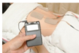
Fig. 2. TENS

TENS has a monophonic pulse shape (rectangular waveforms, triangular and unidirectional sinus half waves), biphasic (symmetrical biphasic and sinusoidal symmetrical biphasic pulses), and polyphonic patterns (there are sine waves and interference or mixed forms). Monophonic pulses always have some results in the collection of pulses of electrical charge in the network, so that electrochemical reactions will occur in systems that are characterized by a sense of heat and pain if the use of intensity and duration is too high. TENS has a pulse frequency ranging from 1 to 200 seconds. The high pulse frequency of more than 100 pulses per second causes a contraction response and vibration sensibility, so the muscles get tired quickly. While low-frequency electric currents tend to be irritating to the skin system, yet the pain is suffered when it reaches the high intensity. Medium frequency electric currents are more conducive for electrical stimulation because they do not cause skin resistance or irritating and show a deeper penetration. Fig. 2. shows the TENS device.