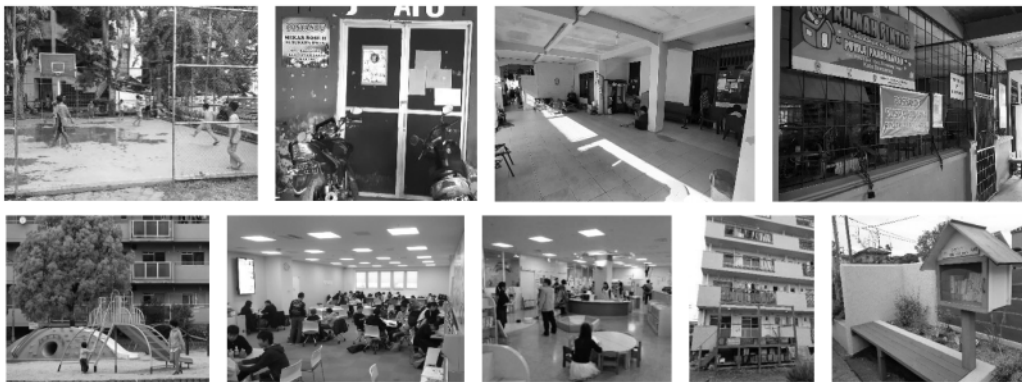
Figure 6. Facilities available for children in several housings and its surrounding area in Indonesia (above) and Japan (below)

Space on a micro scale. This space is the area on each floor of the vertical housing, which is right next or in front of the dwelling units, often in the form of circulation space on each floor. As explained earlier, in this space, there are activities of toddlers and their parents, and activities of