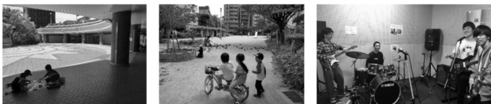
Figure 5. Diverse children's activities covering wider areas