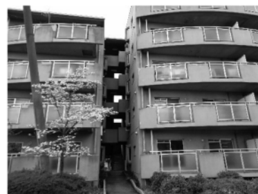
Figure 3. The planned shapes of the vertical housings