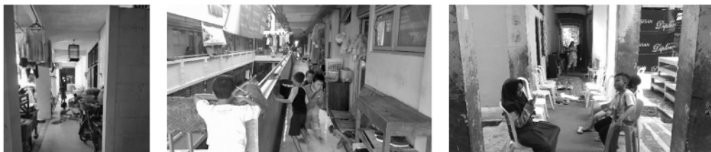
Figure 4. Children's activities in the corridor of vertical housings in Semarang

The facilities provided in the buildings are often found on certain floors of the building, especially the ground floor, which includes a children's medical check-up facility, a small library and reading room, prayer rooms, as well as multipurpose rooms that can also be used for children's gathering and playing. The facilities provided outside the building are very diverse. On the site of vertical housing, parks, playgrounds, and sports facilities are often provided. As previously described, on the outside of the vertical housing site, more complete facilities are available for children, such as educational facilities, health center