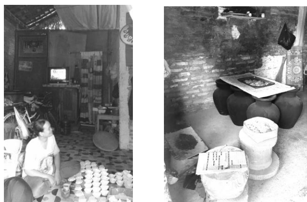
Figure 4. Inhabitant create pottery handcraft in their own houses

The current development or transformation of core houses receives a positive response from the occupants. Various forms of transformed core houses reflect their various needs, capabilities, and priorities. Therefore, the transformed core houses have various roles and capabilities in fulfilling the occupants' needs. Within the framework of Maslow's hierarchy of needs, basically the occupants gave positive response toward fulfilment of the needs by the current house form. An important point in post-disaster housing reconstruction program is concern with the development of core houses that could also support the recovery in family's economic condition. There were people who worked as pottery craftsman in their houses before the earthquake in Kasongan village. Through the implementation of core houses as an in-situ housing reconstruction, the craftsman could immediately return to conduct their economic activities of creating pottery to support their livelihood (Figure 4). Therefore, their economic aspect as craftsman can also immediately be restored.