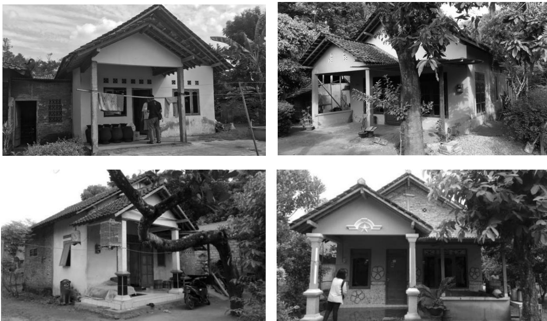
Figure 3. Core houses that have been transformed by the occupants

The core houses receive positive response from the beneficiaries. The occupants satisfy with the core houses because they can receive support after the disaster struck. However, the point of strength and fast