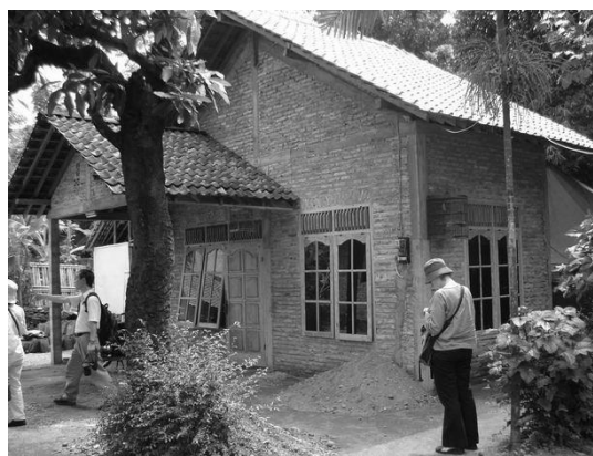
Figure 2. In-situ core house as one type of post disaster housing reconstruction program

Various post-disaster housing reconstruction programs were delivered in Kasongan Village. One of the housing reconstruction programs was in the form of donation of core houses from the Bengkulu Province. This program was one type of housing reconstruction implemented right after the disaster with the form of in-situ reconstruction (Figure 2). Core house was starter house that could be occupied immediately and then developed incrementally along with the occupants' need and capability. The core house was developed in the former lot of the beneficiary. It had 18-m 2 -floor area with a gable roof style. Stone foundation and concrete steel column were used in the construction with bricks wall and roof tile from clay.