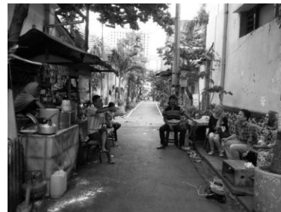
Figure 3. Temporary social space