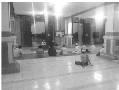
Figure 2. Permanent social space