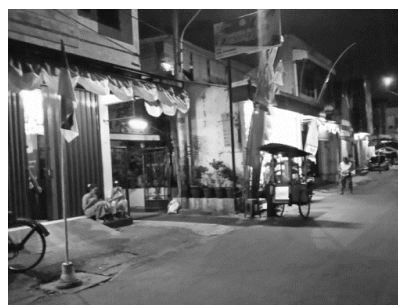
Figure 4. Dynamic social space