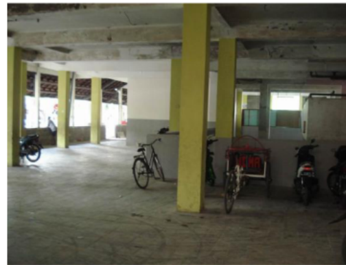
Fig. 18 A space in Sombo where the elderly held Posyandu Lansia activities temporarily every month.