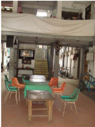
Fig. 19 Meeting space developed by the inhabitant in Menanggal using space between blocks. Source : field survey, 2012