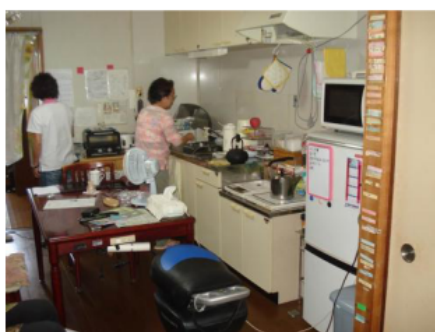
Fig. 10 The elderly in Japan is doing her daily activities such as washing, cooking with modern equipments.