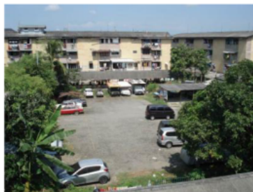
Fig. 3 Menanggal housing in Surabaya, Indonesia.