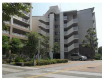
Fig. 6 Hyogo prefectural housing in HAT Kobe area, Kobe, Japan.