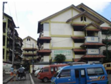
Fig. 4 Sombo housing in Surabaya, Indonesia.