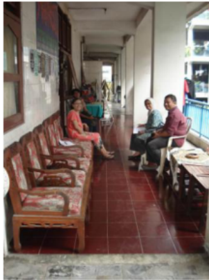
Figure 21. Elderly using corridor in front of their unit to do meeting individually or organically.

planting, chatting, and meeting each other (Fig. 21 and 22). This condition could give benefits in developing social cohesion, which in turn can give various benefits, such as creating companionship and passive supervision system for the elderly. Therefore the corridor could become an active space which is support the elderly live in high-rise housing.