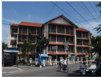
Fig. 1 Pekunden housing in Semarang, Indonesia.

Qualitative method is used because this study has the nature of exploration. The data of housings design and its facilities, the elderly activities and their opinions about their housing environments, are collected through field observation, interview with the residents and key persons, literary study and institutional survey. The collected data are analysed through describing regularities, discovering patterns of activities and its properties, advantage and disadvantage of the existing condition, and then interpreted qualitatively to conclude the conceptual model of the elderly friendly high-rise housing. Validity of analysis is made through triangulation between interview with the elderly, interview with key persons, and photographs or other evidences. Field survey conducted in high-rise public housing of: Pekunden and Kaligawe in Semarang, Indonesia (Fig. 1 and 2 ); Menanggal and Sombo in Surabaya, Indonesia (Fig. 3 and 4); Kobe Municipal Government and Hyogo Prefectural Government in HAT Kobe area, Japan; and Akashi Municipal Government in Uozumikita, Akashi, Japan (Fig. 5, 6, and 7).