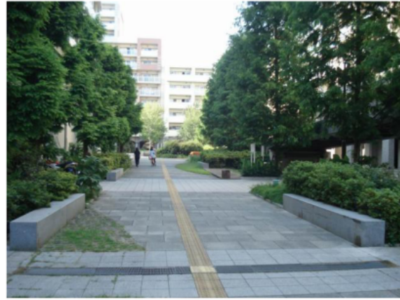
Fig. 20 An accessible and comfortable living environment in HAT Kobe area support the elderly to live healthy and self-reliantly.

The other facilities provided for the elderly and inhabitant in high-rise housing are sports field, religious facility especially for the moslem such as mosque or musholla, and daily needs facility such as shops and market which can be met in Pekunden housing. These facilities mostly located in the ground floor. Therefore it needs an effort from the elderly to access these facilities since there is only stairs provided for vertical access. In Japan, especially in HAT Kobe area, shopping and the other public facilities are located in the other block of surrounding neighborhood, but it does not give burden for the elderly because the accessibility of the surrounding neighborhood is convenient and safe for them. Neighborhood with safe and convenient access for the elderly is needed because it encourages the elderly to become self-reliant, and they can also take care for their health through walking exercise in their surrounding neighborhood (Fig. 20).