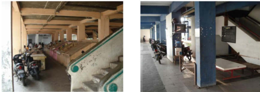
Fig. 13 The absence of elevators makes the elderly who live in the upper floor have to find the common facilities in the ground floor by stairs.