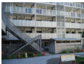
Fig. 5 Kobe municipal housing in HAT Kobe area, Kobe, Japan.