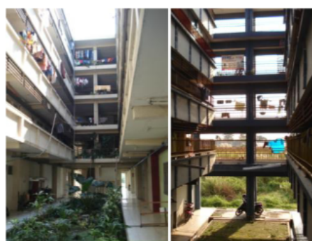
Fig. 12. The existence of connecting corridors in Pekunden and Kaligawe make the elderly can conduct their activities and create social contact with other who live in other blocks easily.