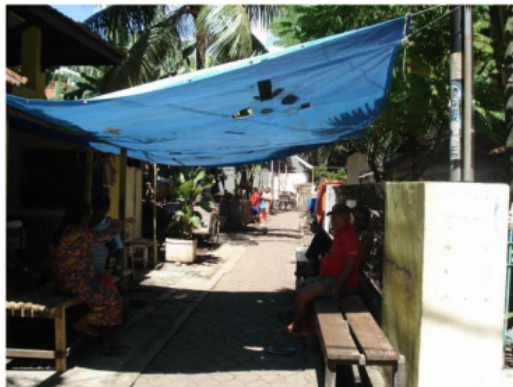
Fig. 17. A space created by the inhabitant for gathering in Sombo.

initiated by the community. These are spaces to conduct common activities which are managed by certain community organization as well as the one which are not organized by certain community organization (Fig. 17). The location could take places in building spaces which are intended for the community's common activities and also in other spaces such as circulation spaces and open spaces. The implementation of these kinds of spaces could have a nature of temporary or only provided whenever it is necessary until the spaces which have more permanent in nature (Fig. 18).