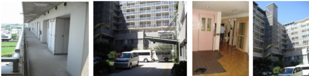
Fig. 14 The existence of connecting corridors and both stairs and elevators in HAT Kobe and Uozumikita make the elderly can conduct their activities easily, make social contact with other who live in other blocks, and serve the elderly an comfortable access to utilize facilities in their neighborhood.