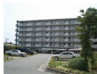
Fig. 7 Akashi municipal housing in Uozumikita, Akashi, Japan.