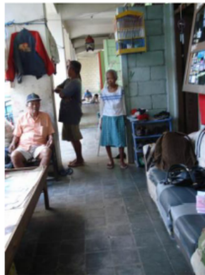
Fig. 8 Elderly in Pekunden is taking a rest in front of their unit after conducting daily activity.