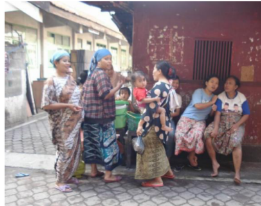
Figure 22. The elderly and friends are chatting and caring baby in a corner of an alley in Sombo.