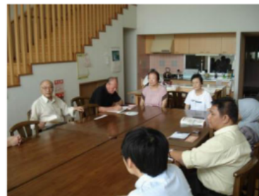
Fig. 16 A common space provided in every three levels in Collective Housing of HAT Kobe for the inhabitant to conduct common activities such as gathering, chatting, etc.

Related to the facilities in the case studies, basically it can be categorized into two groups: spaces which are developed or designed by the designer of the building, and spaces which are developed according to or initiated by the community who conduct activities in the neighborhood 3 . The first group has the form of common or public spaces, whether in the form of special places which are intended to accommodate the inhabitant activities or through circulation space as a place which could be utilized by the inhabitant (Fig. 15). There is a concept of Collective Housing in the Hyogo Prefectural high-rise housing in HAT Kobe, Japan. In this housing there are special spaces or facilities provided for the inhabitant as a place to conduct common activities such as gathering, chatting, and conducting other daily activities together (Fig. 16). The second group is facilities or spaces which are developed or