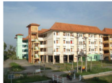
Fig. 2 Kaligawe housing in Semarang, Indonesia. Source : field survey, 2012