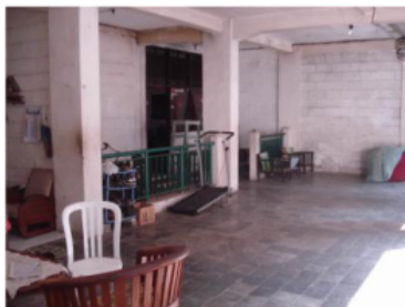
Fig. 15 Hall in each floor in Indonesian housing such as in Pekunden is a facility provided to support social activities for the inhabitant.