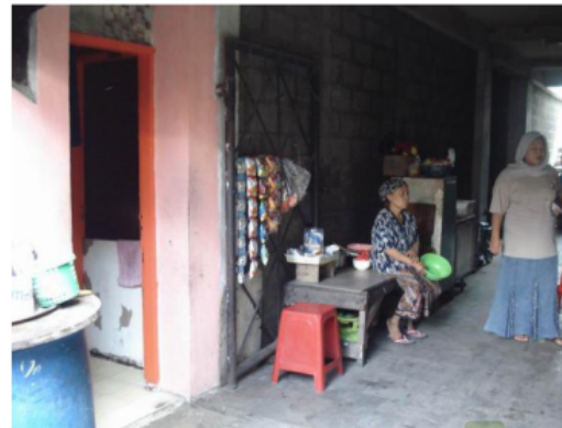
Fig. 9 Elderly in Sombo is selling food and drinks in front of her unit. Source : field survey, 2012

In Japan, the individual activities conducted by the elderly is mostly daily activities according to their needs, such as housekeeping as well as activities which is supporting them to survive (Fig. 10 and 11). The activities are walking around their neighbourhood, visiting and reading in nearby library, and become a member of social organization outside of their neighbourhood. Therefore they can live healthy with self-reliantly condition. These individual activities are conducted routinely. In the neighbourhood which has Silver Housing concept, community wellness centre is provided, and supported with Life Support Assistance (LSA). The LSA supports the common facility which is provided in Silver Housing for the elderly who live in the neighbourhood. They provide activities such as simple gymnastic, karaoke, games, making origami, and playing music, as well as supervision toward the elderly condition. In this facility, the elderly create companionship between each other. These activities are not an obligation to be followed by the elderly who live in the neighbourhood, rather than they are provided for them who want and need activities which have been programmed by the LSA. The elderly who still in healthy condition and active are self-reliant and they create their own activities based on their need and hobbies.