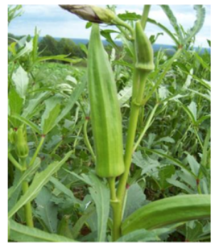
Figure 1 Okra Fruit (Abelmoschus esculentus).

The dosage variations of okra flour given in this study were 0.1; 0.2 and 0.3 g/Kg-body-weight-(BW)/day(d) (Naeem, Mohammad and Ali, 2018; Sabitha, Ramachandran and