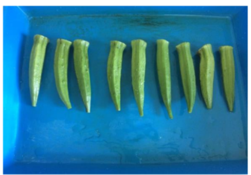
Figure 2 Preparation of Okra flour.

Antioxidant activity test of okra flour was carried out at the Diponegoro University Integrated Laboratory. Analysis of antioxidant activity with DPPH method was referring to the