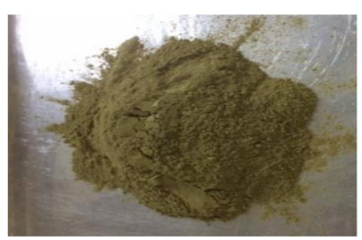
Figure 4 Okra flour.