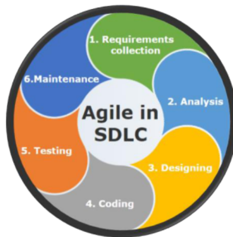
Fig. 1. Agile Stage.

This stage begins with determining what needs are needed for the system to solve problems opportunities by identifying user needs to provide correct progressive solutions. In addition, at this stage, it also defines the output to be produced, the features of the application, and the functions of the application being developed [13]. At this stage, analysis is carried out by decomposing the complete system into its component activities by identifying and evaluating problems, opportunities, obstacles, which occur, and the expected needs so that improvements can be proposed.