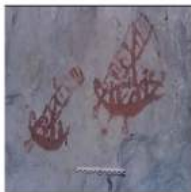
Fig 2. The Painted Boat on the Wall Cave in Muna Island, Southeast Sulawesi.