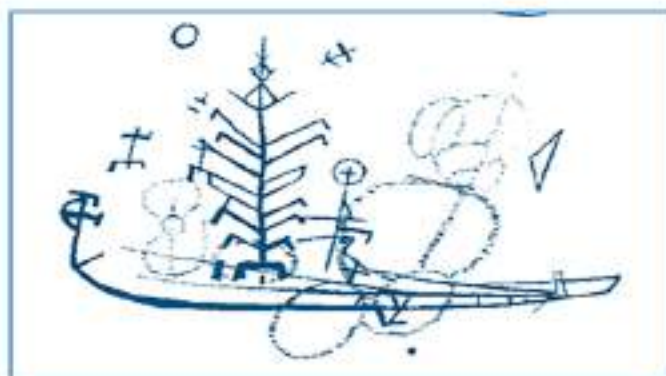
Fig 3. Motive Sketch of Prah Sasorewera.

New waves of migrants of the Austronesian-speaking peoples entered the region. These peoples might have been another Mongoloid sub-race inhabiting Taiwan (Formosa) (Bellwood, 2004; Blust, 1984). Through the Philippines, they continued their journeys to the Celebes, Java, Sumatra, Borneo and up to the Malaysian cape. Some of them stayed in mainland Southeast Asia and became the ancestors of the Champ, a small minority inhabiting southern Vietnam. In the later period, the Austronesians also spread to Madagascar island. The migration waves of the Austronesians to the east raced as far as Fiji and Tonga approximately in 1500 BC and moving into the Pacific to inhabit the Polynesian islands, covering an area stretching as far as New Zealand and Hawaii (Cribb, 2001).