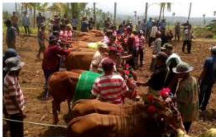
Fig 5. Kerapan Sapi often becomes ritual for rain in Bondowoso.

Nowadays, the Kerapan Sapi in Bondowoso is used as a ritual medium to beg for rain as blessing. Usually, the ritual is held in one of the residents' fields followed by approximately 20 participants from some areas surrounding Wiringin and Bondowoso. The Kerapan Sapi is no longer presented as in the Dutch colonial era, because the audience abuses it as a gambling event.