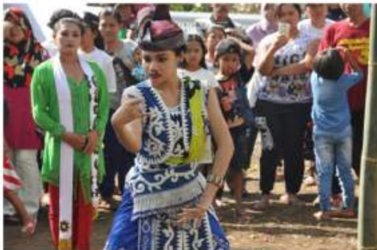
Fig 13. Remo dance as a welcome dance (Research Document)

After the ritual Petik Kopi, the local people and tourists who were presenting the ritual were treated to the performance of Madurese culture. The first performance was proceeded with Remo Dance as a heroic dance and as a welcome dance. The dance signified a style and movement in accordance with the local area surrounded by agrarian communities, so that it showed swift movements which become the characteristics of regional movements, namely Pencak Silat. The following figure is the representation of Remo Dance as an initial performance after completing Petik Kopi ritual.