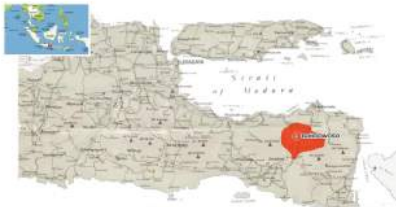
Fig 1. The map of Bondowoso Regency, 1970

In its beginning of establishment, the Besuki Residency consisted of two afdeeling s, namely Besuki Afdeeling and Probolinggo Afdeeling . Yet, in 1820, Panarukan, Bondowoso, and Kraksaan Afdeeling were included in the coverage area of Besuki Residency. In its development, Besuki had experienced rapid progress during the leading period of Regent Ronggo Kiai Surodikusumo (Mashoed 2004), especially with the presence of Besuki Harbor. The large number and densely population of migrants that populated Besuki had led to an expansion of the area. The Regent Ronggo Kiai Surodikusumo comprehensively gave instructions to Raden Bagoes Assra (originally from Pamekasan, Madura) to clear up the forest in the southeast area of Besuki. The forest that was successfully cleared up was later named Bondowoso (Soerjadi 1974), and that Raden Bagoes Assra was the first regent (Regent I) of Bondowoso (1819-1830).