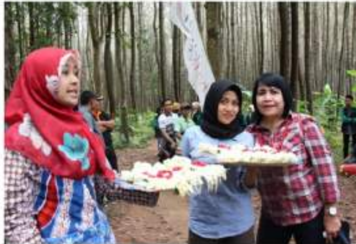
Fig 10. A bouquet as one of the requirements for Petik Kopi Ritual (Researcher's instrument)

The Tumpeng Rice is paraded into the coffee plantation. Usually, it is the result of mutual cooperation of coffee farmers. After prayer, the rice is eaten together. Then, the Regent begins picking or harvesting coffee as a sign of the beginning of the coffee harvest. In 2017, Petik Kopi ritual was attended by 22 representatives from European countries that were also members of the SCAE (Specialty Coffee Association of Europa). The ritual in 2017 was the ritual that had invited number of tourists, both domestic and foreign tourist (see Figure 12).