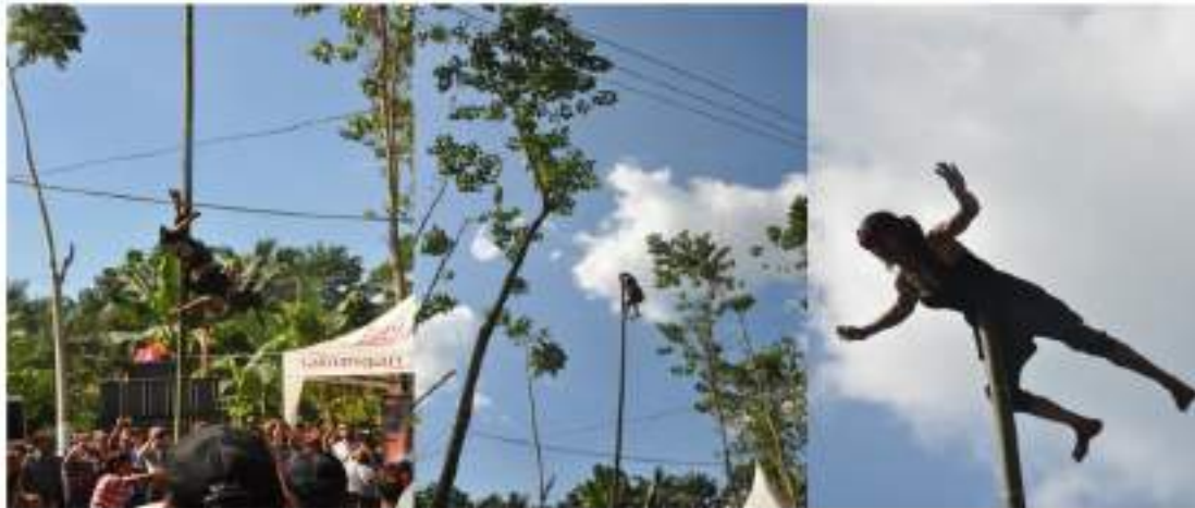
Fig 15. Pojen Dance (Research Document)