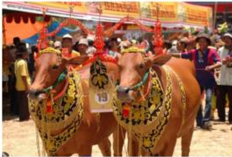
Fig 7. Sapi Sonok contest in Madura in 2018