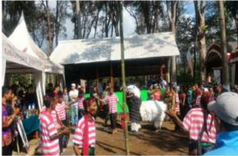
Fig 14. Bamboo being embedded on the ground as a medium for dancers to climb the bamboo (Research Document)