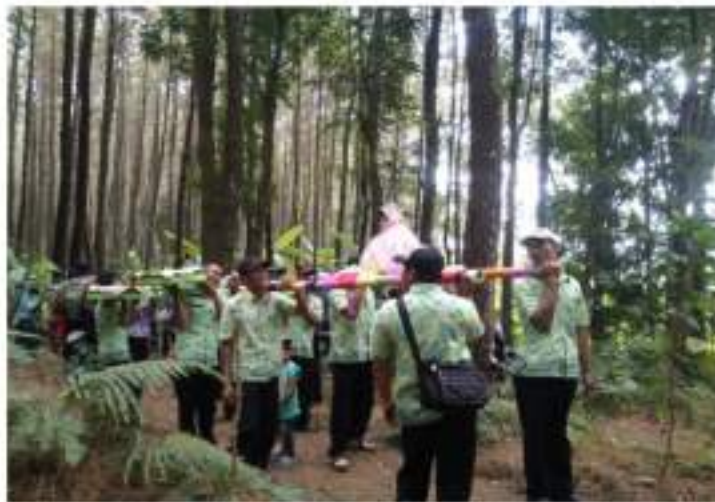
Fig 11. Tumpeng as a ritual equipment for Petik Kopi ritual (Researcher's instrument)

The Tumpeng Rice is paraded into the coffee plantation. Usually, it is the result of mutual cooperation of coffee farmers. After prayer, the rice is eaten together. Then, the Regent begins picking or harvesting coffee as a sign of the beginning of the coffee harvest. In 2017, Petik Kopi ritual was attended by 22 representatives from European countries that were also members of the SCAE (Specialty Coffee Association of Europa). The ritual in 2017 was the ritual that had invited number of tourists, both domestic and foreign tourist (see Figure 12).