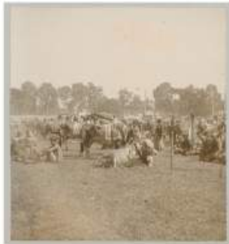
Fig 6. The Sapi Sonok (Cow Beauty) contest of 1898.

Sapi Sonok can be defined as a cow that is dressed as beautiful as possible. All cows who can participate in this event must be female ones. The cows that are contested are formed in pair and are coupled with a tool called Panggonong . The cows are controlled by a jockey, walking slowly to the rhythm of the typical gamelan music. It is the swing and harmony to the beat, and the beauty of the cow will be the point to be marked. In the race arena, there is a 'catwalk' which is prepared completely with a carved gate at the finish line. The cows that have been dressed will set its feet on a wood that has been prepared in the finish line. The following picture is the implementation of Sapi Sonok contest during the Dutch colonial period which was held after the coffee and tobacco harvest period had been completed. The purpose was to entertain the community of Bondowoso whose majority of work was a labor at coffee and tobacco farming. The entertainment was regularly held annually by the Dutch colonial government and supported by investors who rented land for large plantations. The investors had an interest in the exhibition, so that the workers were entertained and happy. Besides, they were more active in working on their plantations.