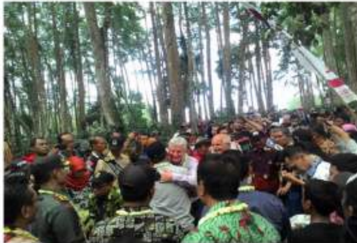
Fig 12. Petik Kopi ritual in Bondowoso Regency that was attended by 22 representatives of European Countries as members of the SCAE (Research Documents)

After the ritual Petik Kopi, the local people and tourists who were presenting the ritual were treated to the performance of Madurese culture. The first performance was proceeded with Remo Dance as a heroic dance and as a welcome dance. The dance signified a style and movement in accordance with the local area surrounded by agrarian communities, so that it showed swift movements which become the characteristics of regional movements, namely Pencak Silat. The following figure is the representation of Remo Dance as an initial performance after completing Petik Kopi ritual.