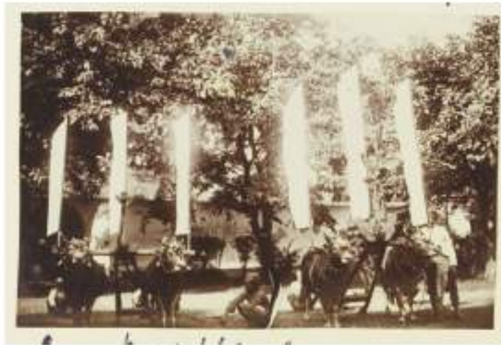
Fig 4. A portrait of Kerapan Sapi in Bondowoso, 1907.

mentioned above, apart from being slaughtered for European to consume, the cattle was also used for Cow Fight, Kerapan Sapi, and Sapi Sonok.