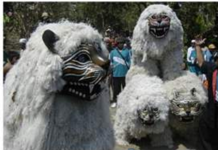
Fig 8. The art performance of Ronteg Singo Ulung

The art of Ronteg Singo Ulung has become more interesting because of the attractions in it, such as dancing, jumping over lions, and entering a circle of fire. In the attraction, Ronteg Singo Ulung was accompanied by musical instrument. This is what distinguishes Ronteg Singo Ulung with other arts performance like Singo Barong and Barongsai. Singo Ulung consists of two categories, namely Singo Ulung in the traditional ceremony of "Bersih Desa" and Singo Ulung in the form of Ronteg. The musical instrument used in the Singo Ulung art performance in "Bersih Desa" and Ronteg has a slight difference, namely in the number of musical instruments. Singo players in Ronteg Singo Ulung are usually played by boys with 20-25 years old, while in Ronteg, age is an important factor, because there are always movements that use body strength, such as high-jumps, body flip, and so on (Astuti 2009). The following picture is the art performance of Ronteg Singo Ulung in Bondowoso Regency.