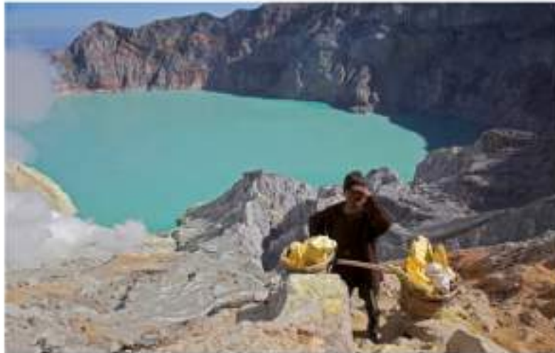
Fig 3. Ijen Plateau, enchantment of Blue Fire and Belirang products

During the Dutch colonial period, cow (cattle) breeding was very important. Madurese people were talented to be cow breeders, because they were motivated by the pleasure of cow fight, Kerapan Sapi and cow (cattle) exhibitions. Up to 1928, the local government of Besuki had provided a premium in cow fair. Cow fight and Kerapan Sapi were frequently held in Bondowoso Regency, and it had become a joy for the people of Bondowoso who were factually Madurese (ANRI 1978b). Usually, the Dutch colonial government held cow fight and Kerapan Sapi in Public Garden of Bondowoso, especially when the coffee and tobacco harvest seasons were over. Besides, the Dutch colonial government usually held these exhibitions to entertain the community of Bondowoso plantation. At the exhibition, cow fight, Kerapan Sapi, and Sapi Sonok (cow beauty contest) were usually held. The evidence that cow (cattle) breeding is greatly important in Bondowoso can be seen from the population below.