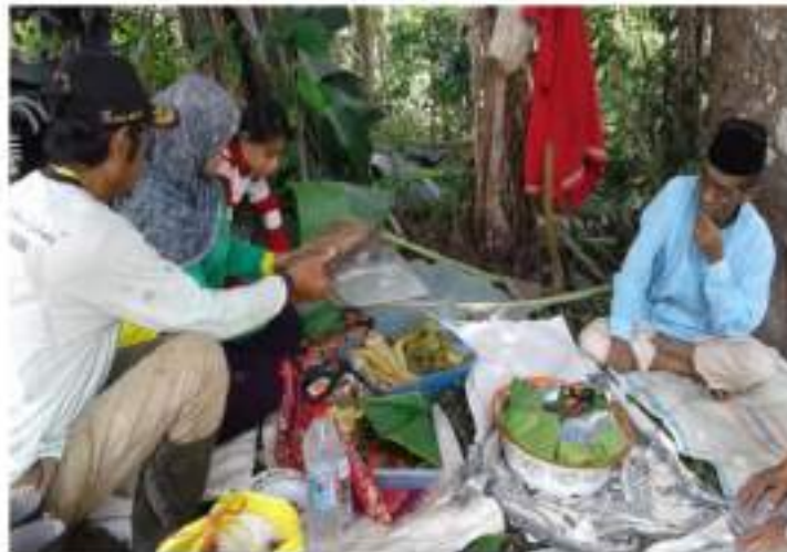
Fig 9. Individuals perform Petik Kopi ritual and led by Kyai (Research Document)

The majority of the economic life of the Bondowoso's community is supported by coffee plantations, so that the culture that sets in the community is related to rituals and farming on coffee plantations. The ritual performed by coffee farmers in Bondowoso is Petik Kopi ritual which relates to worship on natural rulers and ancestral spirits to appeal for the success of the coffee harvest and the welfare of its people. This cultural commitment is inseparable from the myth for cultural supporters to maintain and preserve harmony in the life of the coffee farming community in Bondowoso Regency. It seems that coffee farmers oblige themselves to perform a ritual before harvesting coffee which purposes to get an abundant coffee harvest and avoid the theft of coffee. Usually, the farmers make a scoop of rice (Tumpeng) accompanied with fried chicken, beef, vegetables, snacks, coffee, and incense brought into their plantations. They also invites Kyai (religious leaders) to lead prayers and end up by having meal together. They also invite their labors to join in. The event is ended with incense burning in their garden. The following picture is a ritual performed by individual coffee farmers in their coffee plantations when harvesting coffee.