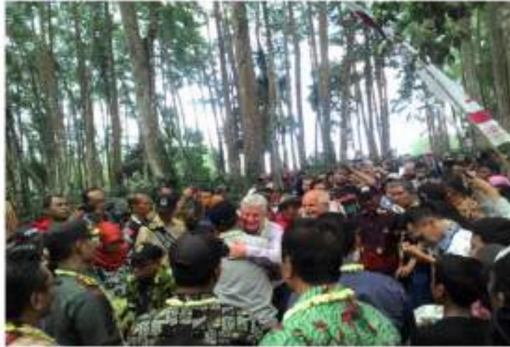
Fig 12. Petik Kopi ritual in Bondowoso Regency that was attended by 22 representatives of European Countries as members of the SCAE (Research Documents)

After the ritual Petik Kopi, the local people and tourists who were presenting the ritual were treated to the performance of Madurese culture. The first performance was proceeded with Remo Dance as a heroic dance and as a welcome dance. The dance signified a style and movement in accordance with the local area surrounded by agrarian communities, so that it showed swift movements which become the characteristics of regional movements, namely Pencak Silat. The following figure is the representation of Remo Dance as an initial performance after completing Petik Kopi ritual.