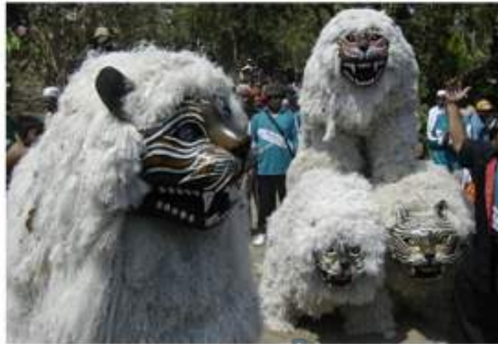
Fig 8. The art performance of Ronteg Singo Ulung

The art of Ronteg Singo Ulung has become more interesting because of the attractions in it, such as dancing, jumping over lions, and entering a circle of fire. In the attraction, Ronteg Singo Ulung was accompanied by musical instrument. This is what distinguishes Ronteg Singo Ulung with other arts performance like Singo Barong and Barongsai. Singo Ulung consists of two categories, namely Singo Ulung in the traditional ceremony of "Bersih Desa" and Singo Ulung in the form of Ronteg. The musical instrument used in the Singo Ulung art performance in "Bersih Desa" and Ronteg has a slight difference, namely in the number of musical instruments. Singo players in Ronteg Singo Ulung are usually played by boys with 20-25 years old, while in Ronteg, age is an important factor, because there are always movements that use body strength, such as high-jumps, body flip, and so on (Astuti 2009). The following picture is the art performance of Ronteg Singo Ulung in Bondowoso Regency.