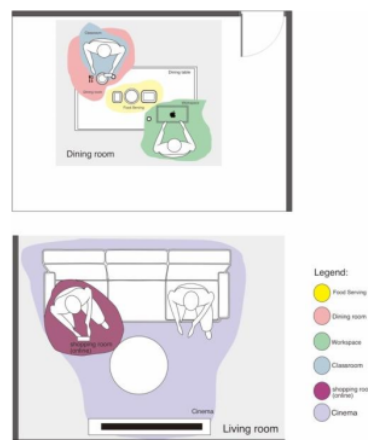
Figure 3. Mapping one of picnic space in domestic environment

Shopping and cooking are the daily activities to meet daily needs (de Certeau et al., 1998). Those activities are undoubtedly inseparable from the domestic environment. However, what is currently happening is that activity restrictions do not allow us to shop at the market/mall hence the use of online shopping activities. In addition, work and school activities that usually require us to eat out are currently happening in a domestic environment. So that at work/school, what happens is to bring up a restaurant in the domestic environment through a food delivery service application. We can easily visit several restaurants at the same time. So that food can construct the domestic environment into a restaurant that we usually visit. Another picnic activity is visiting several places outside the domestic environment, although currently, we can only visit them virtually. That makes it easier for us to see what a place we want to visit looks like; with advances in technology, we can quickly move from one place to another. Although it does not deliver the atmosphere directly, this activity may serve as a picnic in the domestic space.