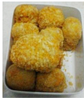
Fig. 2: Fresh Tempe nugget (left) and deep-fried Tempe nugget (right) for intervention. Each size is equal to 25 grams