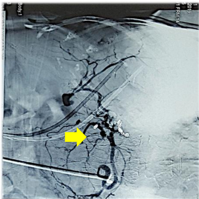
Figure 1. Pseudoaneurysm (yellow arrow) of right hepatic artery