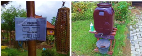
Fig. 7. Cleanliness and health facilities that provided in the Kampung Jawi tourist area.

Based on physical integrity, the community assessed that the facilities in Kampung Jawi are suitable with what is needed by the community and tourists. Facilities that need to be improved are facilities to support cultural preservation, such as art buildings, cultural galleries, and others. In the conditions of the Covid-19 pandemic, the Kampung Jawi tourist area was equipped with health and cleanliness facilities according to the new normal habit protocol. One of the important things to improve tourist destination's quality is hygiene, including cleanliness in tourist areas and the availability of cleaning facilities [13]. There is a washbasin, temperature gauge, queue divider, and health protocol posters. However, cleanliness and health facilities are only available in the Angkringan Pinggir Kali area. Therefore, the cleanliness and health facilities still need to be improved. The pandemic encourages tourists to be more aware of safety and cleanliness [21].