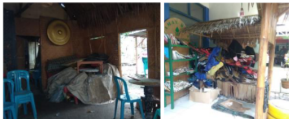
Fig. 6. Cultural instruments were neglected during the Covid-19 pandemic.

Community wellbeing in the socio-cultural aspects related to how local culture contributes to tourism development. In pandemic conditions, the local culture of Kampung Jawi still contributes to cultural activities. Even though out of a total of 11 cultural attractions, only 1 opened, tourists are still interested in coming to Kampung Jawi. Tourist attractions that still elevate cultural values are important to strengthen the cultural pillars in sustainable tourism [17]. Local control can be seen from community activities in managing Kampung Jawi, for example, community forums which are held regularly every week and every month. However, during a pandemic, the intensity of community forums is reduced. The forum is only held whenever there is an urgent need, such as when there is damage and additional facilities.