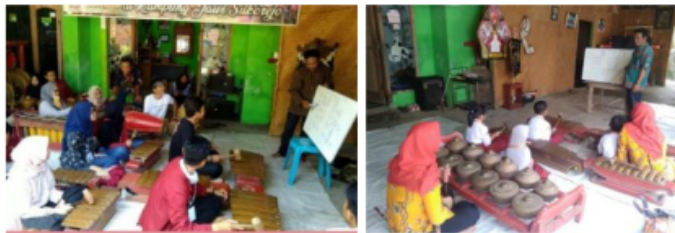
Fig. 5. Cultural practice and education activities before the Covid-19 pandemic.

Initially, cultural activities in Kampung Jawi included cultural practices, performing arts, and traditions that were held every 2 nd day. During the Covid-19 pandemic, these activities had to be stopped and postponed. The COVID-19 pandemic has a major impact on tourism and culture, with restrictions on movement and travel, outdoor activities, and large gatherings [14]. Traditional musical instruments, performance costumes, and other art instruments are neglected because they are rarely used. Meanwhile, resources include funds and facilities to support cultural preservation in Kampung Jawi are limited. Funds come from non-governmental organizations or communities, supporting facilities such as art buildings and performances are not yet available.