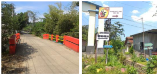
Fig. 3. Accessibility Support Facilities to the Kampung Jawi Tourist Area.

Kampung Jawi tourism is managed by a tourism awareness group called Pokdarwis Kampung Jawi. The main role of Pokdarwis Kampung Jawi is to manage the tourism development of Kampung Jawi, including planning, implementing, monitoring, and evaluating activities. Members of the Pokdarwis Kampung Jawi are 70 local people of Kampung Jawi. Pokdarwis Kampung Jawi participated in trainings organized by the government. The trainings that were attended included training in tourism promotion, tourism management, tourism innovation, and others. During the Covid-19 pandemic, Pokdarwis Kampung Jawi received a lot of direction on health protocols that must be implemented in tourist areas. Kampung Jawi was also strictly monitored by the Culture and Tourism Office during the pandemic.