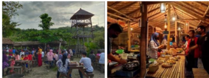
Fig. 4. The situation in Angkringan Pinggir Kali (the only attraction open during the Covid-19 pandemic).

In the economic sector, tourism provides a high multiplier effect, so if this sector falls it will cause a large domino effect, for those who are directly or indirectly involved [16]. The Covid-19 pandemic caused many tourism actors have be cut off temporarily or permanently [17]. People who work in the tourism sector such as tour guides, parking attendants, transportation services, and so on, get uncertain income even lose a job. Most of the local community are high school graduates and not equipped with sufficient knowledge about economic resilience. In this case, the government has an important role in restoring the tourism economy during the pandemic through the provision of stimulus in the form of funds, planning for the recovery of the tourism sector, and directing the local community [18].