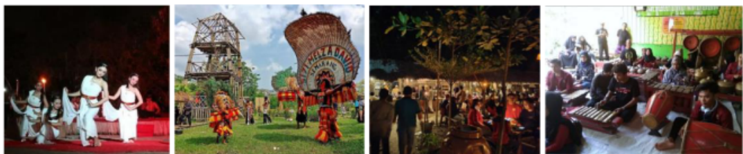
Fig. 2. Tourist Attractions in Kampung Jawi Before Covid-19 Pandemic.

Cultural tourism attractions in Kampung Jawi can be grouped into 4 types: Traditional culinary, Javanese culture education, art performances, and Memetri Kampung Jawi tradition. Each group of attractions consists of several cultural and artistic activities, with a total of 11 activities that tourists can enjoy. Tourists can visit Kampung Jawi from morning to night in one tour package. Various cultural activities in Kampung Jawi become a core tourist experience that can attract tourists and improve the quality of the destination [13]. However, during the Covid-19 pandemic, tourists can only enjoy traditional culinary at Angkringan Pinggir Kali. Other tourist attraction 20 had to be stopped indefinitely. This is to prevent activities that cause crowds and reduce the risk of spreading the Covid-19 virus. The pandemic has significantly restricted tourism and cultural arts activities, this condition can threaten the resilience of creative economy and culture [14].