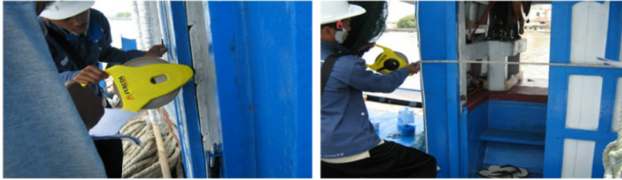
Figure 1. Survey and Measuring of Batang type Traditional Fishing Boat