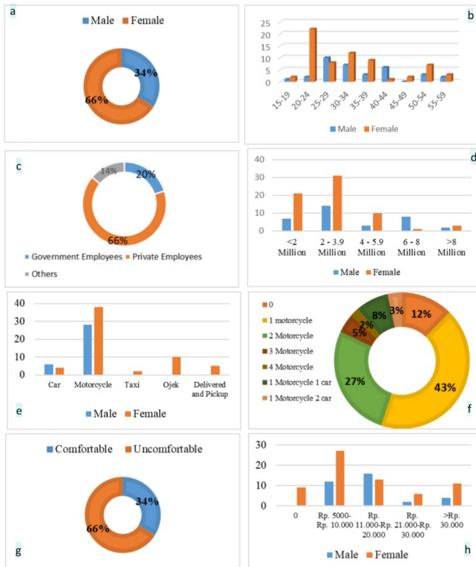
Figure 2. Gender-based behavior in using Private Transportation

11,000-Rp. 20,000. While the female gender, has a lower expenditure of expenditure which is around Rp. 5,000-Rp. 10,000 (Figure 2h).