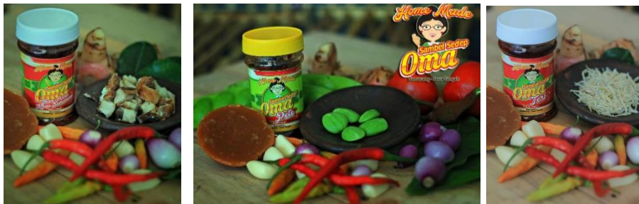
Figure 1. Some variant of SSO products

SSO has produced many homemade sambal variants such as lemongrass sambal, garlic sambal, smoked fish sambal, and anchovy sambal (Figure 1) using natural preservation. SSO sambal products mainly are packaged as a 140 g plastic pot with production capacity ranges 55-60 pots per batch. All SSO products already have PIRT numbers and halal certification. These legal registrations support SSO products to potentially expand their distribution into a wider market area. However, increasing capacity per batch of production become a challenging for the SMEs due to their limited equipment capacity.