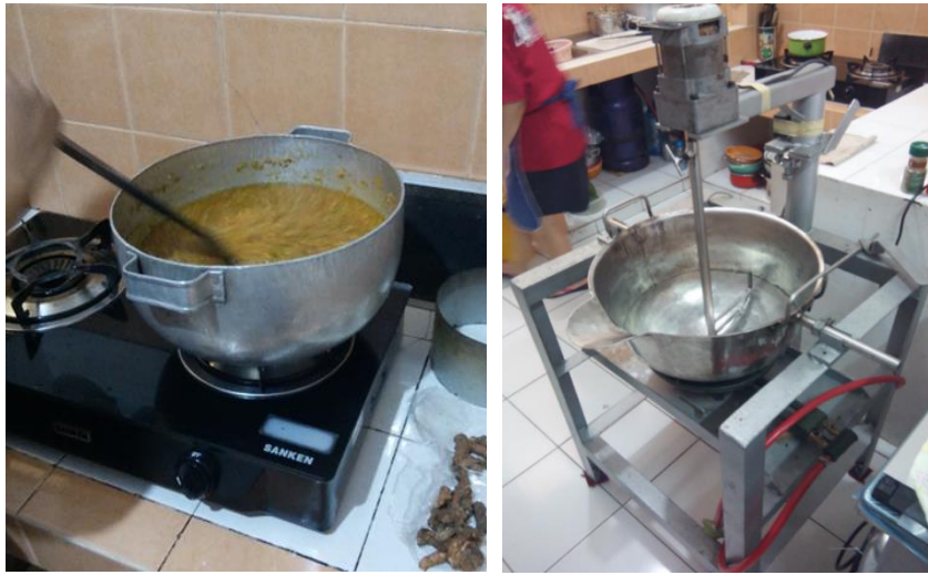
Figure 4. The cooking equipment before (left) and after (right) PPPUD companion process