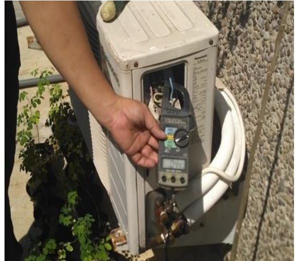
Figure 2: Electrical current measurement

Refrigerant is a liquid used in air conditioners and refrigerators, to absorb the heat from the contents of the refrigerator or space and dissipate heat in the Earth's atmosphere. A refrigerant undergoes phase change from liquid to gas (at absorbing heat) and returns to liquid (when compressor compresses it)[5]. In this study used 2 kinds of R-22 refrigerant containing HydroFuoroCarbon (HCFC) and R-290 containing Propane (Hydrocarbon)