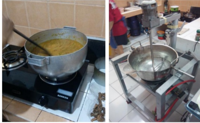
Figure 4. The cooking equipment before (left) and after (right) PPPUD companion process