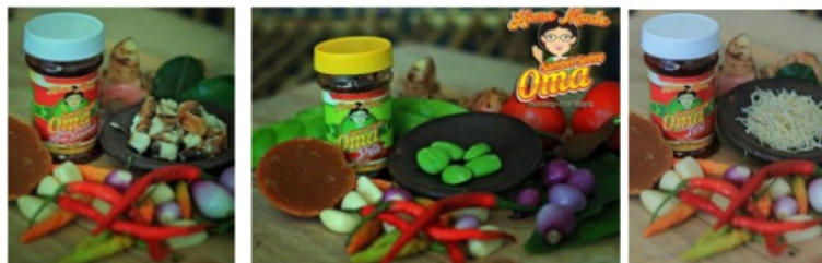
Figure 1. Some variant of SSO products

SSO has produced many homemade sambal variants such as lemongrass sambal, garlic sambal, smoked fish sambal, and anchovy sambal (Figure 1) using natural preservation. SSO sambal products mainly are packaged as a 140 g plastic pot with production capacity ranges 55-60 pots per batch. All SSO products already have PIRT numbers and halal certification. These legal registrations support SSO products to potentially expand their distribution into a wider market area. However, increasing capacity per batch of production become a challenging for the SMEs due to their limited equipment capacity.