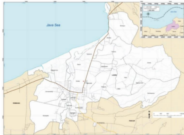
Fig. 2. Lasem as study area

cement industry in the town hinterland can potentially change the structure of the town, not only in economic but also in spatial and social terms. Figure 2 provides the context of Lasem in the region of Rembang and Central Java.