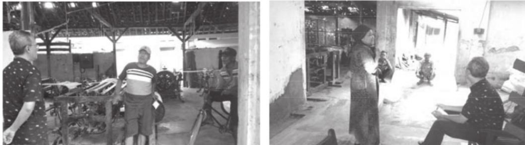
Fig. 5. The Harmony of Workers and Laborers in Clothing Industrial Houses Pekajangan

The existence of a close kinship also plays a role in fostering the local strength of the Pekajangan community. They are entrepreneurs giving each other recommendations to prospective customers, coming together to work together if there is a shortage of raw materials, and the needs of workers. Not only entrepreneurs who have a kinship relationship, but workers also have a fabric of cooperation in meeting their needs. The form of fulfillment can be seen when the pay period arrives, so they