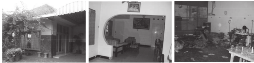
Fig. 3. Clothing Industrial House in Pekajangan

in the 1950s, which was the golden age of the batik industry. With an average area of land ownership, batik artisans began competing to build residential housing as well as a place to conduct production activities. Industrial houses are built with hierarchical spatial architecture, so that they can accommodate residential activities for owners or entrepreneurs, and their workers.