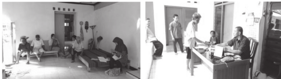
Fig. 4. Patron-Client Relation in Clothing Industrial Houses in Pekajangan

In addition to working relationships as employers and workers, they also collaborate to provide mutual strength mentally and spiritually. The relationship is in the form of a patron-client partnership. Both parties cooperate with one another in certain circumstances by providing loans, here entrepreneurs provide financial assistance to their workers. The workers will repay the loan through a reduction in each income, so that it feels light. However, if they are unable to return it, then they replace