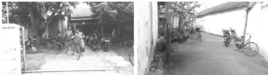
Fig. 6. The View of Clothing Industry Settlement in Pekajangan when Pay Day