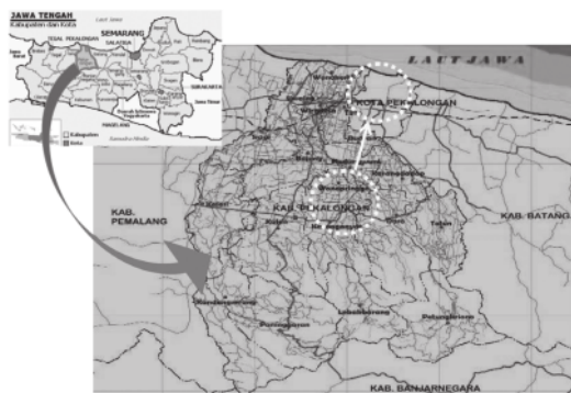
Fig. 1. Development Corridor of Batik Craft in Pekalongan

handicraft business. The development of batik in three areas in Pekalongan is located in a linear path from the South towards the North coast of Java in sequence, namely from Wonopringgo, Pekajangan, then Buaran, thus forming a corridor that supports the marketing system. In contrast to the two regions flanking it in one corridor, the development of batik crafts in Pekajangan is experiencing rapid growth. The growth of batik craft is supported by most of the people, so it can be said that in Pekajangan there was a change in social life in the early twentieth century (Mu'arif, 2012). According to Nurhajarini (2002), social life in Pekajangan changed from an agrarian society to an industrial village.