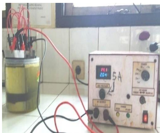
Figure 1. Electrocoagulation equipment of electroplating wastewater

Synthetic wastewater samples were prepared for the experiment using hexavalent chromium [Cr (VI)] solution. The solution of 50 ppm (mg/L) was prepared by dissolving 0,141g of dried potassium dichromate, K_2Cr_2O_7 (analytical reagent grade), in reagent water and dilute to 1 L. Electrocoagulation process using a glass reactor with 2.5 litres of volume. The electrode using aluminum with dimension of aluminum is 10 \times 3 cm with 1 mm thickness. The clamps of the converter were connected to the electrode in series arrangement.