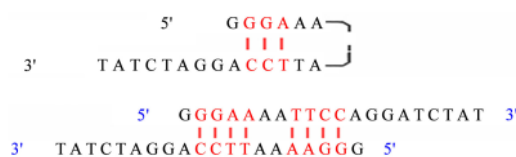
Figure 2. Hairpin and self-complementary and Primer-dimer.