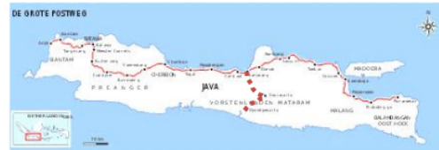
Figure 1 De Groote Postweg from Semarang to Surakarta and Yogyakarta

of Java, the postal communication route leads toward the middle of the island of Java. The Dutch colonial built the first Post Office in Jakarta in 1746, and four years later, they created the Semarang Post Office. Then there is the allegation that the Solo post office was made a few years after the Semarang route to the kingdom of Surakarta and Yogyakarta. According to Hartatik [17], the Pantura Highway is not an entirely new road. Most of these highways used the Mataram Kingdom road. The coastal highway is also a medium for connecting diplomacy between Mataram and foreign envoys, such as VOC delegates.