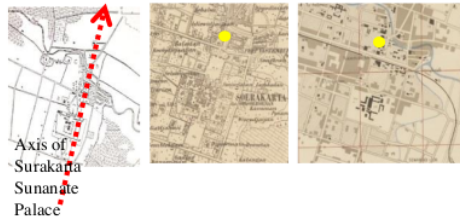
Figure 2 Post Office Location (yellow) at the axis of Kasunanan Surakarta Palace north axis

The post office lay on the north axis of the Surakarta palace in front of the citadel. The application of cosmological concepts in the palace complex refers to the north-south axis, where the castle is the central meeting point of the north-south. The city structure of the building has values that bind to the center. The strength of the identity and character of the city is unity with the existence of the Surakarta Sunanate Palace. The palace and surrounding areas are heritage cities that have heritage tourism potential, namely the Surakarta and Mangkunegara palaces, with local and foreign tourists' specifications.