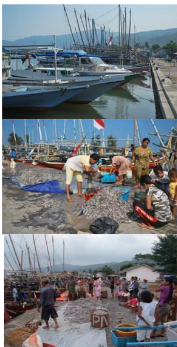
Figure 4. The Mooring of Tourist Boat Moorings alongside Fishing Boats at the Karimunjawa Beach Fishing Port

Karimunjawa is one of the tourist destinations of four priority tourism master plan areas, in addition to Borobudur, Sangiran, and Dieng. Karimunjawa is also projected to be able to attract foreign tourists. The form of support for projecting Karimunjawa is by holding international activities, such as "Sail Krimunjawa" which is held every year.