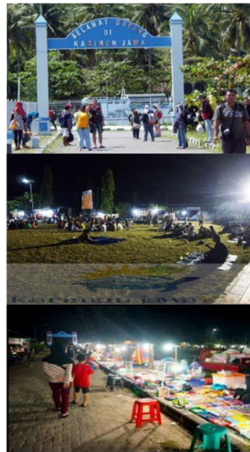
Figure 1. The Entrance Gate to Karimunjawa (Top), the Atmosphere of the Square at Night Shows Many Culinary Tours (Center), and Souvenir Shopping (Bottom).

The layout of the traders which is quite a lot in the Alun-Alun Karimunjawa has been arranged by the trade association of Alun-Alun Karimunjawa and supervised by Karimunjawa's villages and sub-districts. The following is the situation of Alun-Alun Karimunjawa (Figure 1), the layout of Alun-Alun Karimunjawa (Figure 2), and the surrounding area as well as the Google Maps of Alun-Alun Karimunjawa (Figure 3).