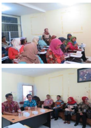
Figure 6. The Business Development Socialization, with Resource Persons from the Government, Business Actors and Central Java Banks