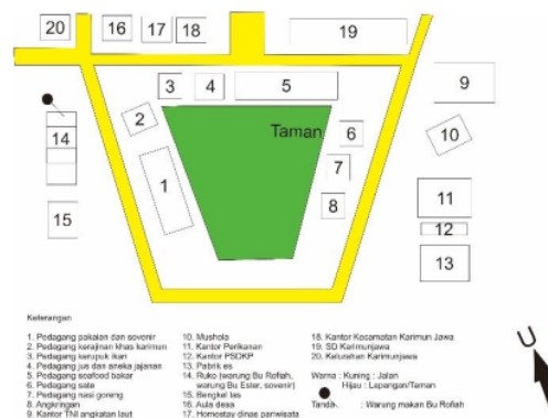
Figure 2. Trading Spatial of Alun-Alun Karimunjawa