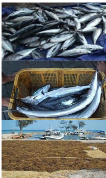
Figure 5. Various Fish Catches and Eucheuma Sp Seaweed Dried in the Fishing Ground

The potential of marine products from Karimunjawa waters is very abundant to support Karimunjawa's tourism development. The tourists can enjoy seafood on Alun-Alun every night with various dishes. In addition, dried anchovy is a typical seafood from Karimunjawa that can be brought home as a souvenir by the tourists. However, the presentation of all marine products is still very traditional and has not paid attention to the quality, and there is no technological touch for the added value of a product. The examples are during this time, the anchovy is only sold in dry form, processed fish is only limited to the traditional dishes and meatballs, and the crackers are made with the poor quality. It is ironic considering that seafood is very abundant and of the high quality because it is still fresh, there is a lot of potential labor from the Karimunjawa community, especially young people and mothers, and the potential large tourist markets and face to face with the people there. In addition to the results of food, the seafood from Karimunjawa is also very potential, such as gamat sea cucumbers which are in the great demand for medicine, and seaweed products for the industry. Thus, all of these marine products have the potential to be developed to increase their added value.