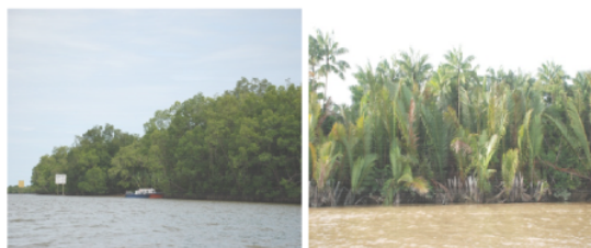
Fig 3. Mangrove ecosystem in Mahakam Delta

Mangrove forest is more frequently flooded by water compared to swamp forest and dry land forest. Mangrove forest only consists of trees not higher than 25 m, others vegetation are rarely found except a new seedling growth of the same variety. This is due to regular tidal flooding upon mangrove forest. Bourgeois et al. (2002) stated that Mahakam Delta is formed through sedimentation process Mahakam River, the longest river in East Kalimantan. It is divided into four vegetation zones, namely: perennial tree of low land tropical forest, palm tree and mixed lowland forest, Nypa mangrove forest and swamp forest. Together, Nypa swamp forest and mangrove forest is jointly termed as mangrove forest as their spreading depends on the presence of sea water. It covers about 60% area of delta. The ability of strong root system of mangrove forest to prevent the coastal area from waves and coastal abrasion makes this area as buffer zone. In Kalimantan, eight mangrove families have been recorded i.e. rhizophoraceae , Avicenniaceae , Sonneratiaceae , Combretaceae , Meliaceae , Myrsinaceae , Euphorbiaceae , and Palmae . The predominant genus in Mahakam Delta is rhizophora , bruguiera , avicennia , sonneratia , luminitzera , xylocarpus , aegicera , excoeria , and nypa (Mackinnon et al. , 2000).