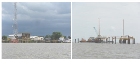
Figure 2. Oil and gas industry in Mahakam Delta

Besides of fisheries, oil and gas activity also exists in Mahakam Delta (Figure 2). Oil and gas industry is the most reliable sector that contributes to the economic development of Kutai Kartanegara. Mahakam Delta is regarded as important area due to the largest producer of oil and gas mining. Thus, it has important impact for the development of this area and its surrounding.