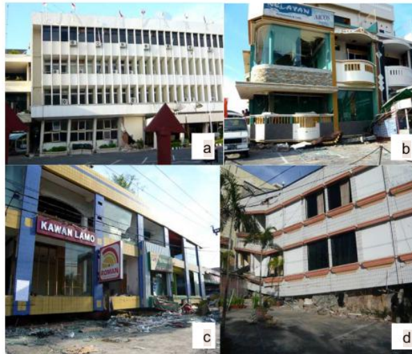
Figure 3.1. The Padang earthquake on September 30 & October 1, 2007: a). The Office of DPU Padang experienced soft story on the 1 st floor but it was still survived, b). The 3 - story-shophouse experienced severe soft story at the 1 st floor. This floor collapsed, and the 2 nd & 3 th floors fell on it, c). & d). Two commercial buildings experiencing severe soft story both at the 1st floor. The 1 st floors collapsed, and the 2 nd and 3 rd floors fell on them.

The aforementioned procedure of calculating columns and beams dimensions that fulfils the strong column - weak beam and non-soft requirements are expected to reduce the potential soft story because the soft story is one of the most dangerous types of building irregularity (Mezzi, 2006). Boen researches in Padang, Bengkulu and Yogyakarta (Boen, 2006, 2007a, 2007b) show that the most frequent and deadly structural failure due to large earthquakes is the soft story (see figure 3.1).