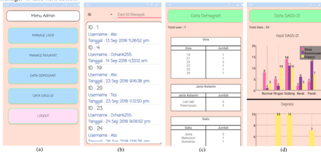
FIGURE 3. (a). Admin menu consists of five sub menus (b). searching function in Manage User submenu. (c). Demography data and (d). DASS-21 data.

Admin has responsibility to manage the user and data base. After login to the system, Admin enters the main menu, which has five submenus, i.e. Manage User, Manage History, Demographic Data, DASS-21 Data, and Logout. FIGURE 3 (a) shows Admin menu which consists of five sub menus and (b) shows the example of searching the user in Manage User submenu. Admin also be able to view the Demographic data and DASS-21 data which presents the profile of all users, as shown in FIGURE 3 (c) and (d). Based on these data, admin can give information to the upper manager to take next action.