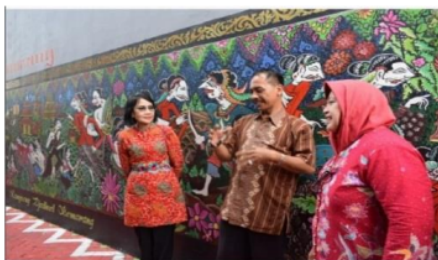
Fig. 3. Mural Paintings in Kampoeng Djadoel