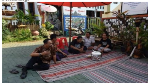
Fig. 2. Kampong Djadoel's community members held a discussion

For future development, the managers of Kampong Djadoel have hopes of making 3-dimensional paintings on village roads, which aim to complete the atmosphere of Kampong Djadoel with historical visualization. The focus of Kampong Djadoel is not batik production, but the frame of batik painting. However, batik cloth will also be produced. Another hope is the compilation of a book on the history of Semarang City so that people who visit Kampong Djadoel are more familiar with the history of the city of Semarang.