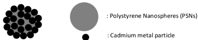
Figure 2. Proposed model of Cd metal particles-covered PSNs body constructed up PSNs-based material thin film

Nevertheless, as we can see in the all aforementioned figures the spherical shape of the both materials particles did not change at all under laser exposure. These phenomena guided us to understanding that the Cd metal particles might have covered fully the surface of PSNs body. It was therefore we could propose a nice model of Cd metal particles-covered PSNs body as it had been sketched out in Fig. 2.