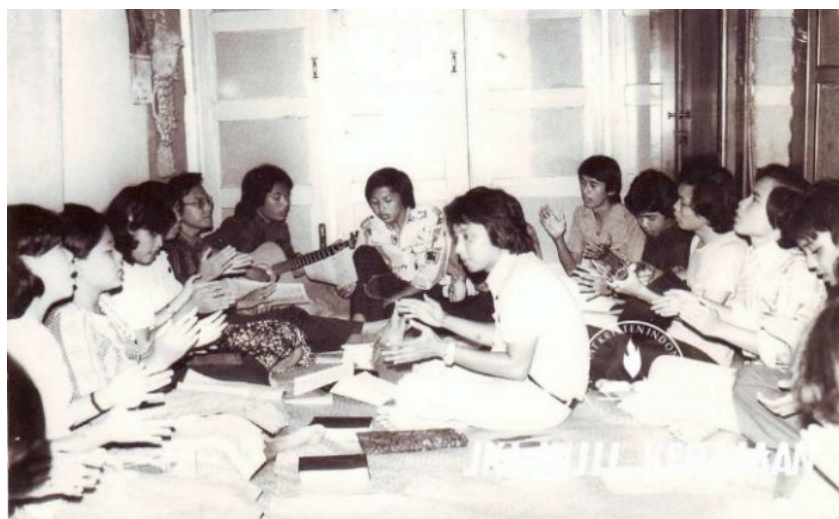
Figure 1. Activities of Kapuran Prayer meeting which is one of the branches of the Sangkakala Family Foundation, 1978.