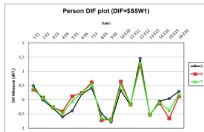
Figure 2. Graphic of DIF based on teaching experience

These items were considered confusing by respondents. This may be because the sentences used are not clear or do not represent the conditions of teachers in the context of inclusive education in Indonesia. Here are sentences of misfit items: