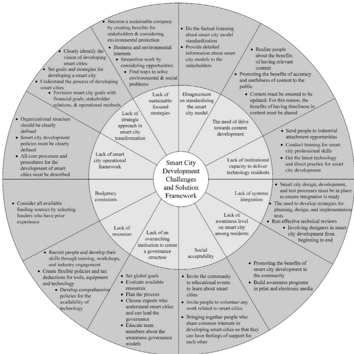
Fig. 3. Smart City Challenges [72]

addition, the community can be a supporting factor for sustainable city development as users of smart city services. Community support in the form of involvement to assess the implementation of smart cities. In the context of smart governance, the community has been proven to assess the implementation of smart governance as one of the smart city stakeholders. Community involvement in smart city assessment as carried out by [9], the community is directly involved in filling out a survey to determine the maturity level of e-government implementation. Community involvement can also be in giving opinions through social media related to the implementation of smart cities. The opinion data can be used as a reference in assessing smart cities, as was done by [13].