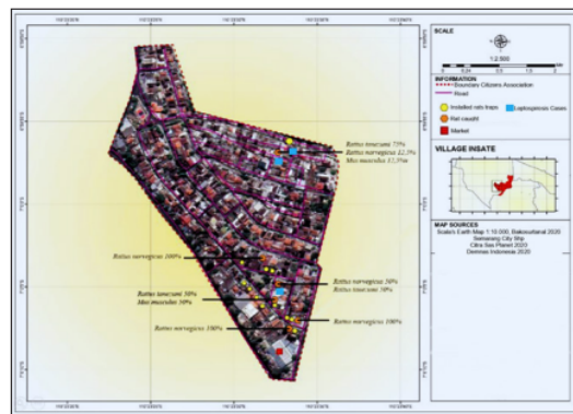
Figure 2. Distribution of Mousetraps and Rats Caught in Settlements around Traditional Market

The total number of rats caught was 22. Rats caught in the housing area around the market were twice as large as the rats caught in the market. Table 2 shows the frequency distribution of the types of rats caught.