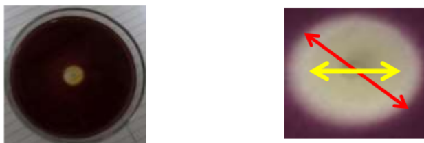
Illustration of the fungi and clear zone

The results shown in the figures represent the grouping of selected outcomes from two sample groups: leaf-twig compost from the shrub habitat in Selomartani Village (Figure 3.1) and leaf compost from the zinc roof habitat of the university parking lot (Figure 3.2). These results display a clear zone indicating the differences between the growing fungal colonies and the clear zones produced by the colonies. The clear zones represent the media hydrolyzed by cellulase enzymes from each grown fungus. For the KR 1 sample, prediction tests were not conducted because the strain died during storage due to improper handling. Figure 3.1 visualizes the largest colonies and clear zones in the order KR 1b > KR 1b2 > KD 1 > KDK 2 > KR 1b2 > KDK 1 . However, it is not this visualization that serves as the qualitative reference for the cellulolytic abilities of fungal isolates, but rather the calculation of the colony diameter compared to the diameter of the clear zone on the media.